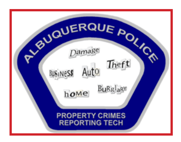
Property Crimes Reporting Technicians patch.